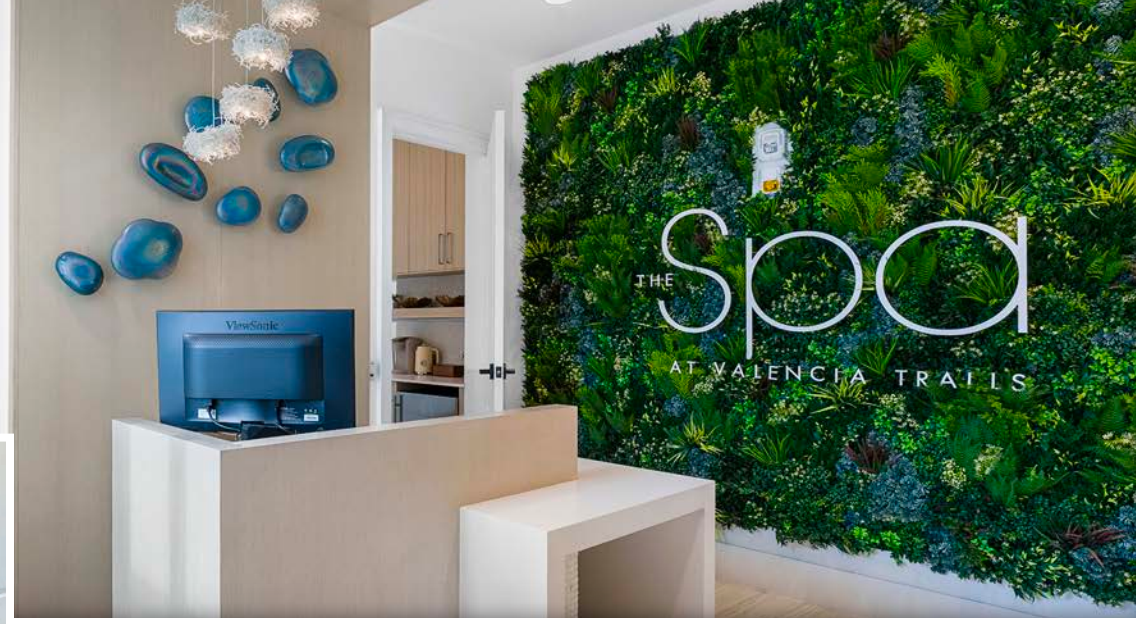
Enjoy a complimentary tea, infused water, mimosa or champagne with any service!