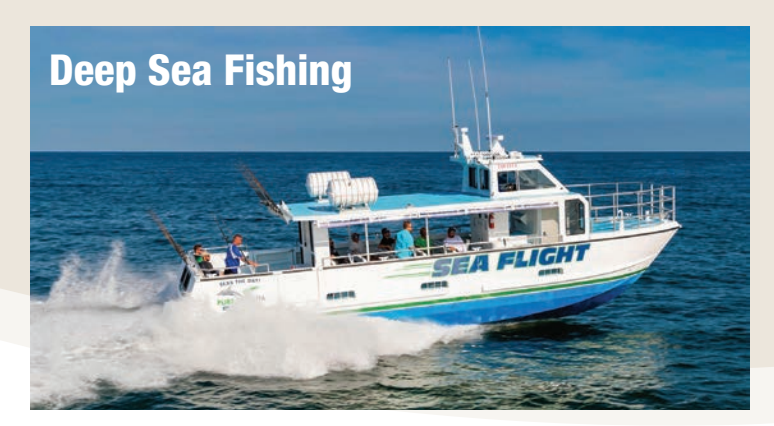
Sunday, August 25th 8 am | Pure Florida | $162.00 (includes tax + fees) Maximum 10 I Deadline August 11th

M/V Sea Flight welcomes guests aboard 4-hour Deep Sea Fishing Trip departing from Historic Tin City Docks in Naples, Florida out to the plentiful waters of the Gulf of Mexico. Fishing aboard M/V Sea Flight offers MORE TIME FISHING than any other fishing boat in the region! Approximately 2 hours of fishing time up to 20 miles offshore. There are a variety of fish we target depending on the season; however, we aim for Grouper and Snapper. With the increased power of M/V SEA FLIGHT and latest state-of-the-art fish finding navigation, Pure Florida's experienced Fishing Captains will find the best fishing spots in the fastest time! We look forward to you experiencing a Fishing Trip aboard M/V SEA FLIGHT! Don't forget, when you fish with Pure FLORIDA everything is included: license, bait, tackle, rods, reels, and cleaning!